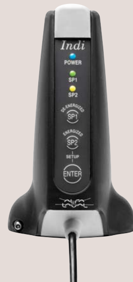
The indication unit IndiTop from Alfa Laval.