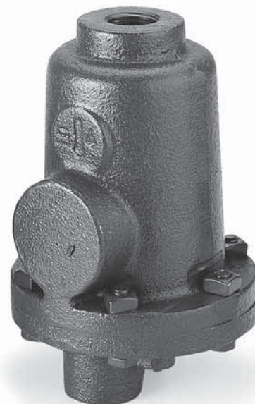
Table LD-393-2. Physical Data Armstrong Guided Lever Liquid Drain Traps (dimensions in mm)

Models 2-LD, 3-LD and 6-LD cast iron guided lever drain traps. Model 1-LD has standard top inlet and optional side connection.